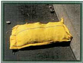
Yellow Monofilament Bags

Woven monofilament/durable, good filtration Yellow color/easily visible to drivers Filled & sewn closed/allows full bag length