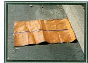
Orange Monofilament Bags

Heavy-weight fabric/strength & durability Filled bags/saves labor & time Double stitched seams/strength & durability Sewn closed/achieves full bag length