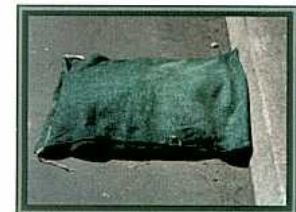
Shade Cloth Bags

Shown filled, sold empty High-strength woven fabric/excellent filtration & flow Green color/visible to drivers Drawstring closure/ease of use Full bag length