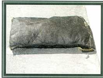
FILLED Roc Soc™

Woven monofilament/durable, good filtration Yellow color/easily visible to drivers Filled & sewn closed/allows full bag length