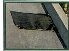
Non-Woven Gravel Bags

Heavy-weight fabric/strength & durability Non-woven fabric/good filtration & flow Double-stitched seams/extra strength, durability