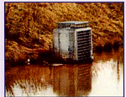
Flat Roof Style - for side weir, collection & retention boxes