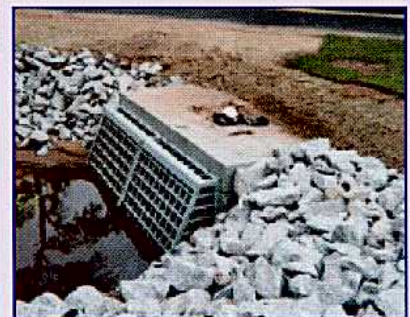
Custom Applications - Call us with your specifications.