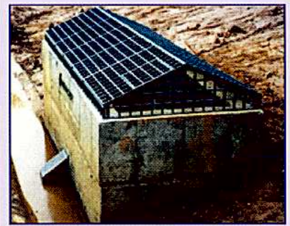
Peak Roof Style - for the top of concrete/precast structures.